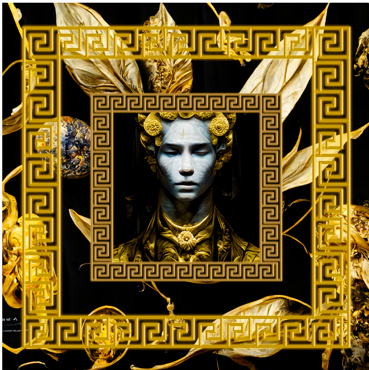
GRECO / 2022 Sublimation on silk 1/2. 3X3 feet