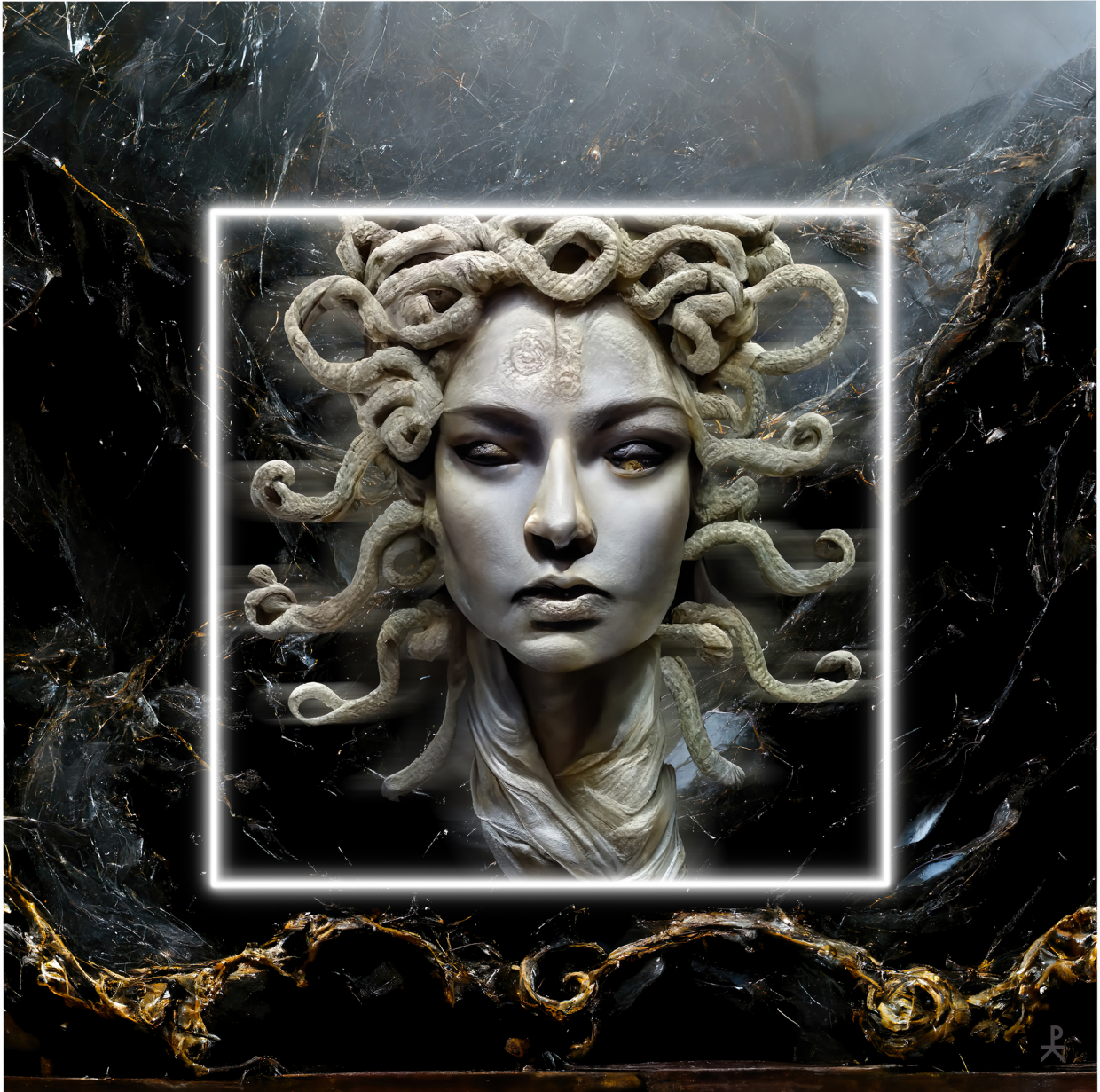
MEDUSA TERRA / 2022 Sublimation on silk 1/2. 3x3 feet