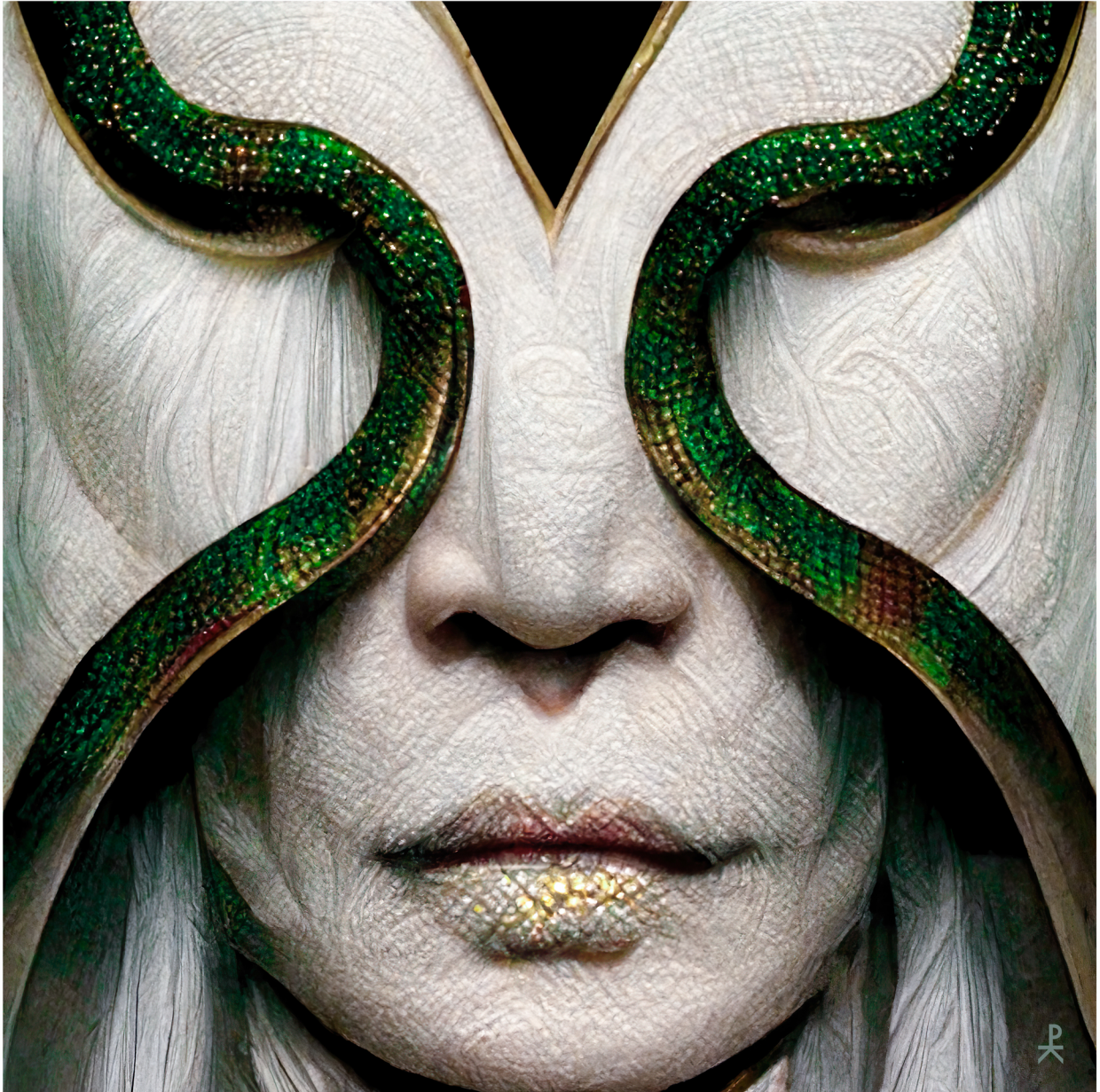
VATIKA / 2022 Sublimation on silk 1/2. 3x3 feet