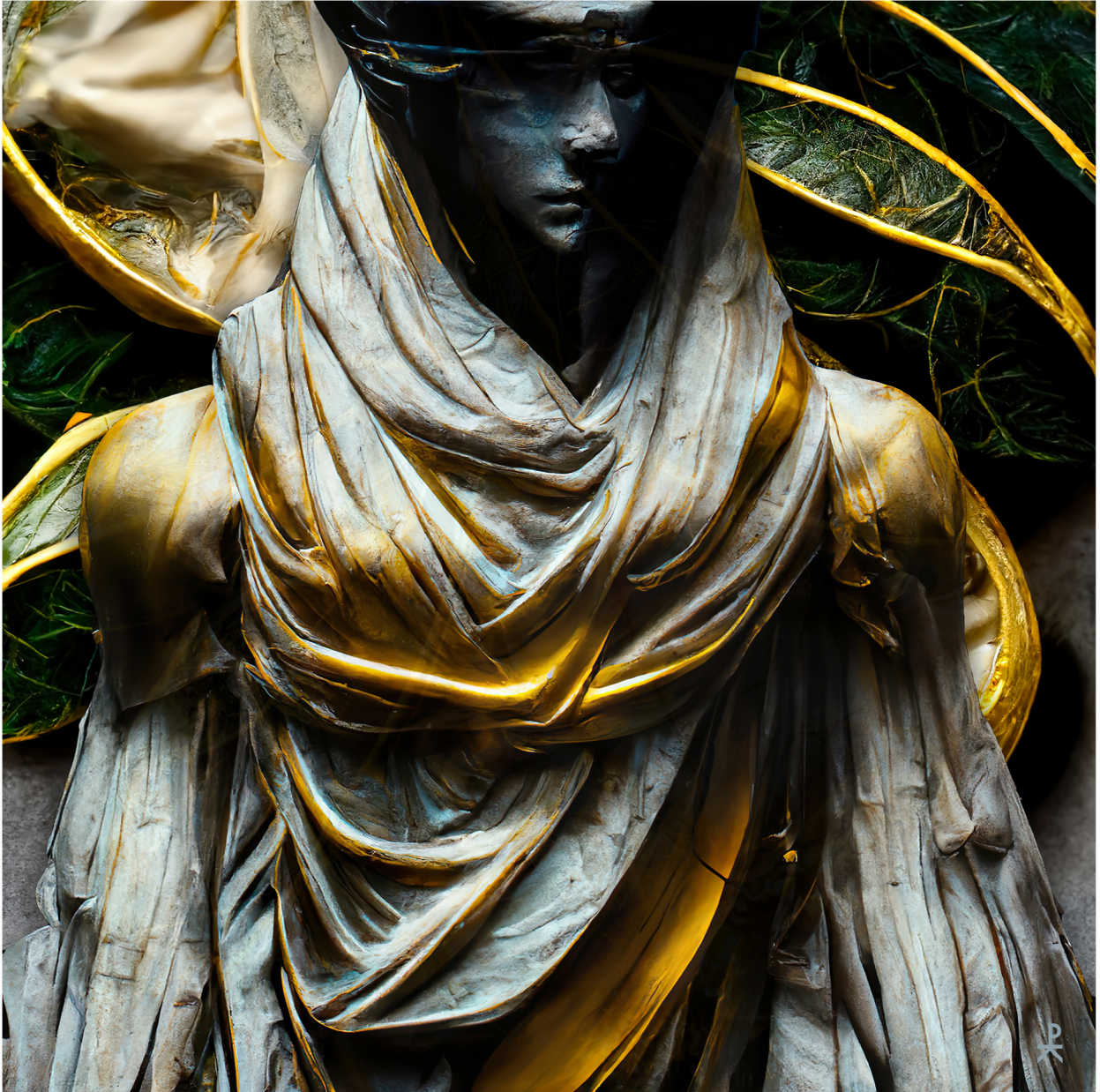
CUORE DI MARMO / 2022 Sublimation on silk 1/2. 4X4 feet