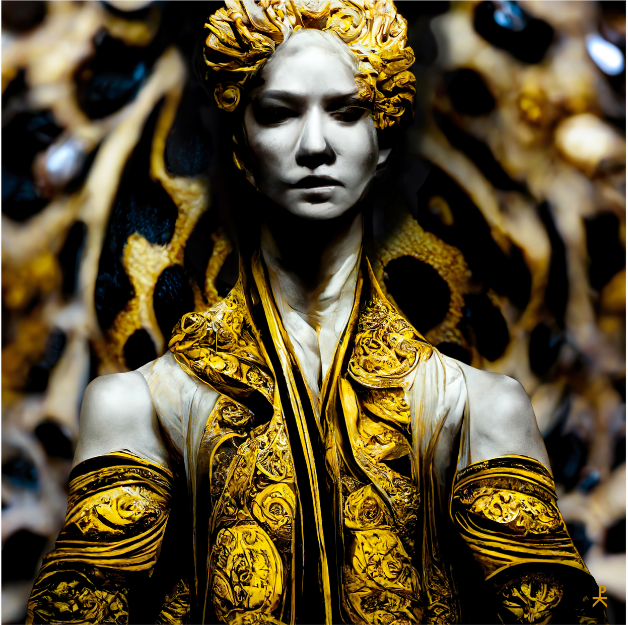
LA FEMME GUÉPARD / 2022 Sublimation on silk 1/2. 2X2 feet