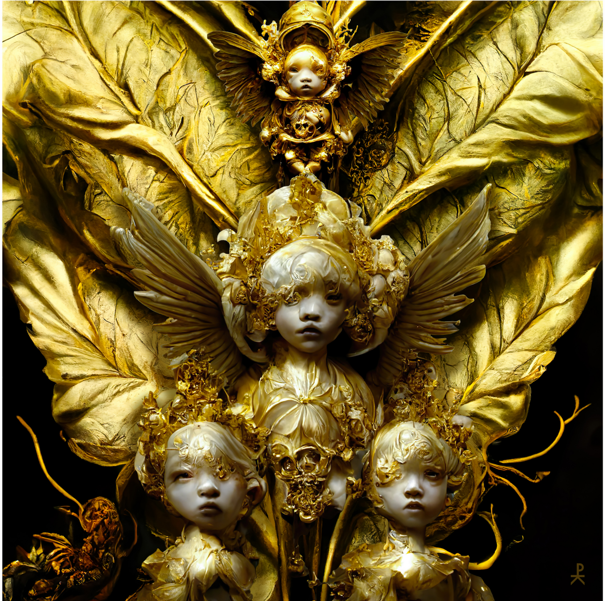
CHERUBS / 2022 Sublimation on silk 1/2. 4X4 feet