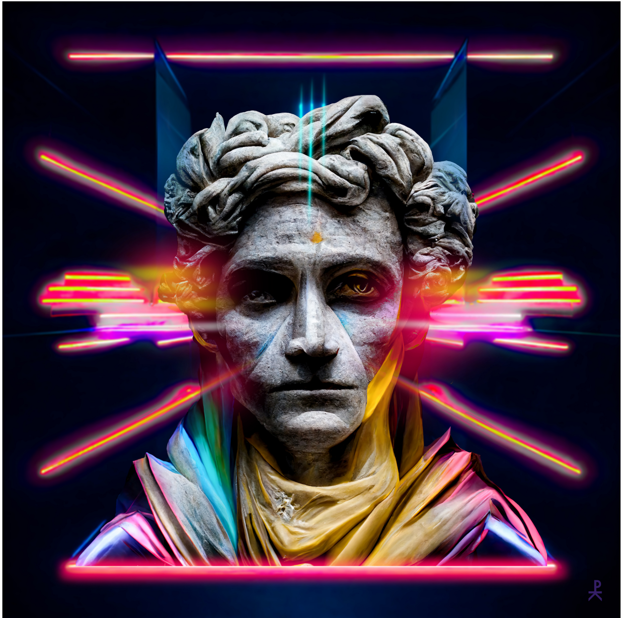
NEON VORTEX/ 2022 Sublimation on silk 1/2. 4X4 feet