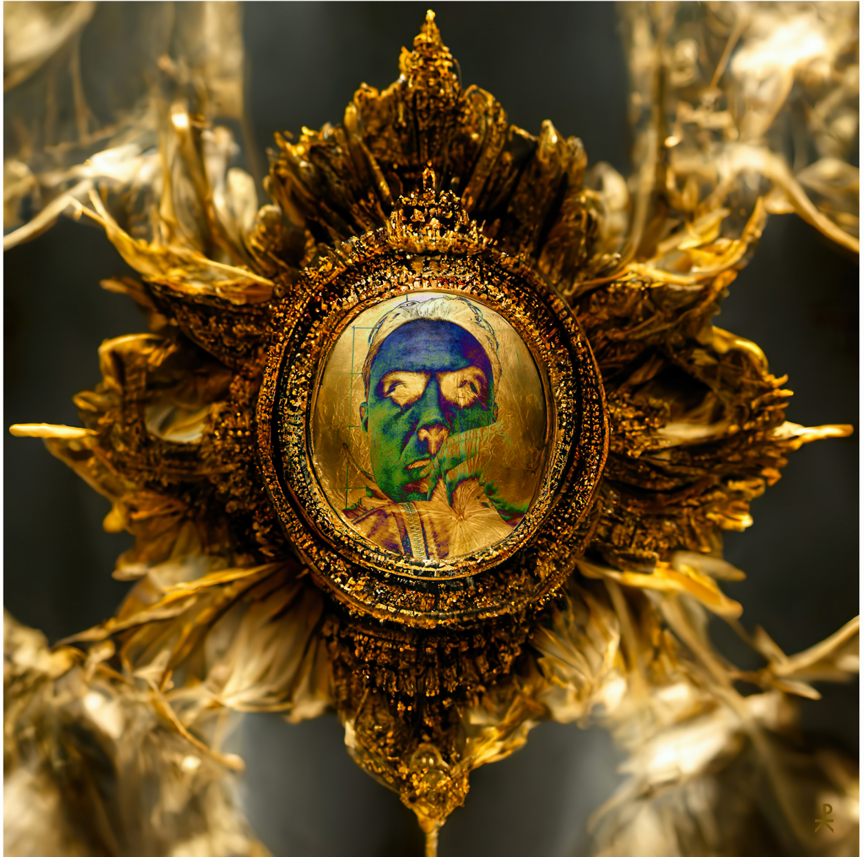
CHRYSALIS / 2022 Sublimation on silk 1/2. 4X4 feet