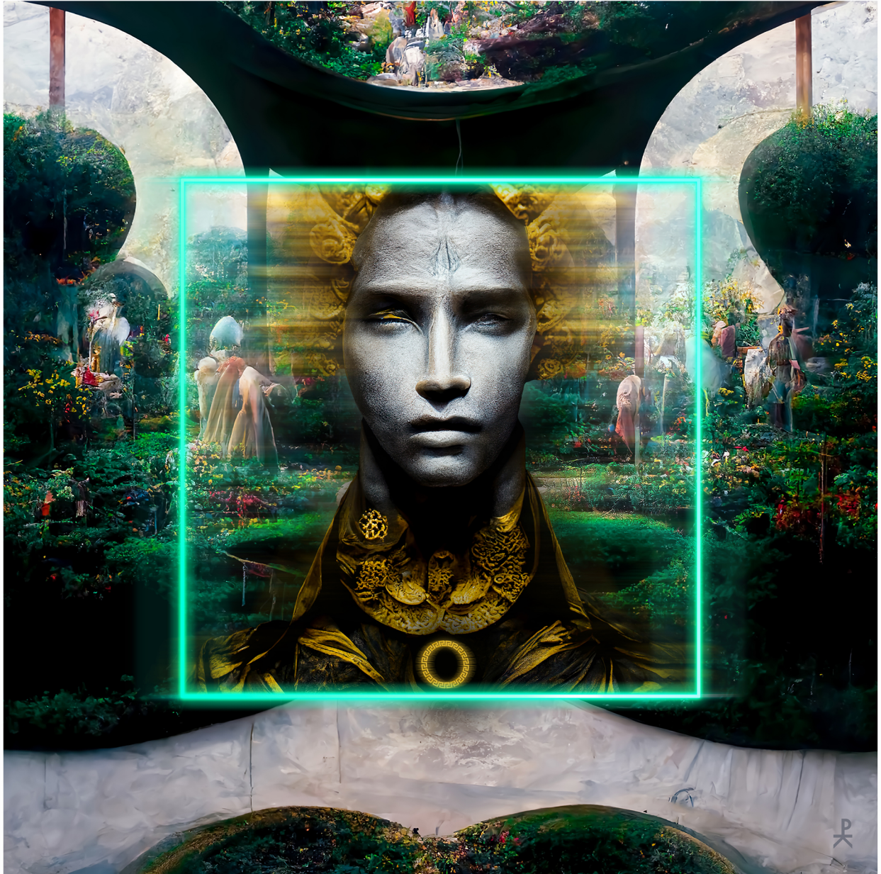
VERSAILLES / 2022 Sublimation on silk 1/2. 2X2 feet