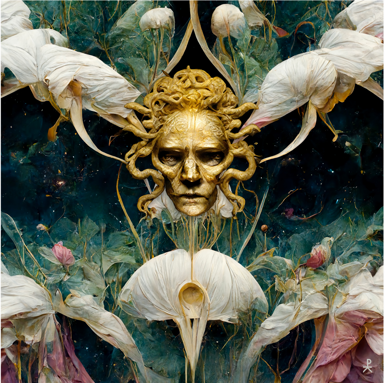
MEDUSA BOTANICO / 2022 Sublimation on silk 1/2. 3X3 feet