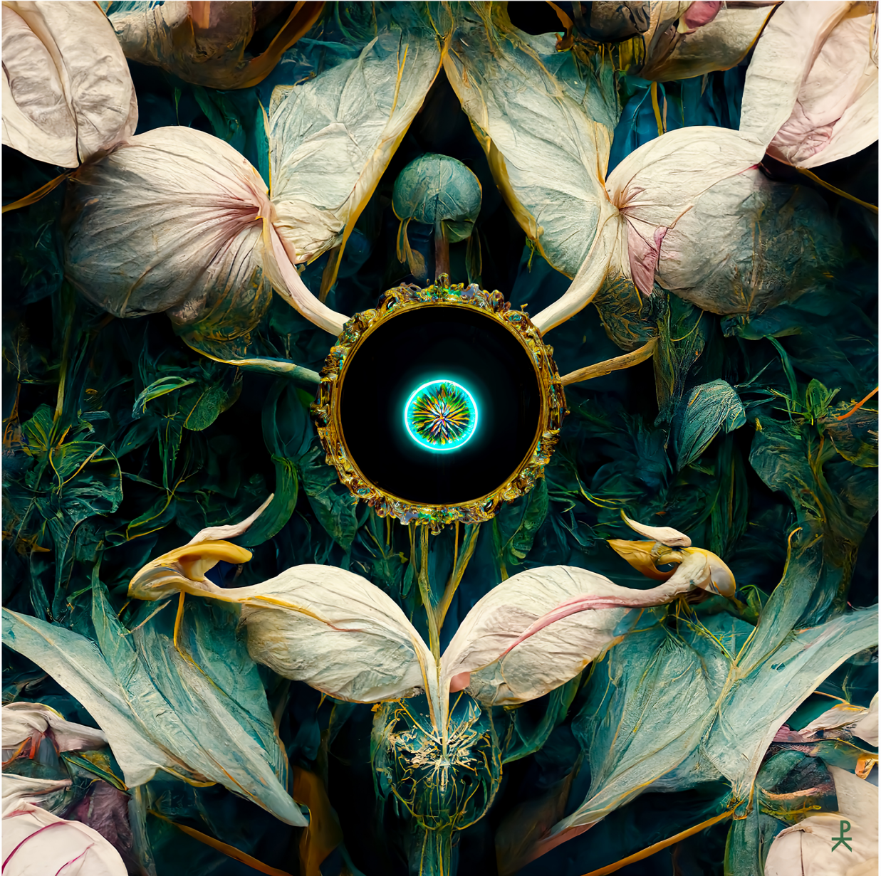
EL PORTAL/ 2022 Sublimation on silk 1/2. 4x4 feet