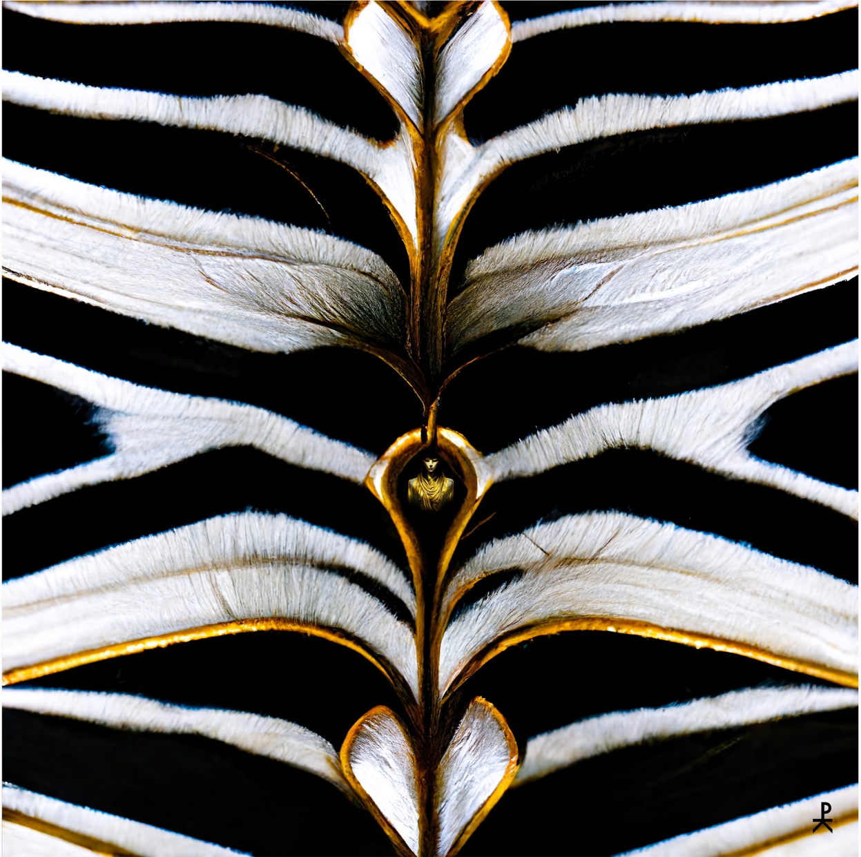
MAKEDA / 2022 Sublimation on silk 1/2. 3x3 feet