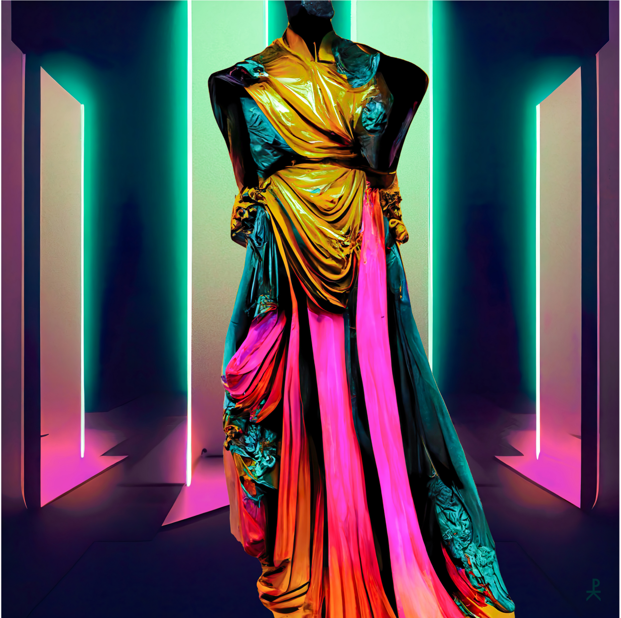
THEODORA / 2022 Sublimation on silk 1/2. 4X4 feet